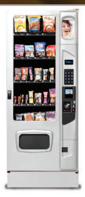
Shown with silver door color & kick panel options.