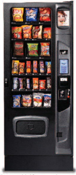
Shown with iCart touch screen & kick panel options.