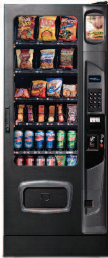
Shown in black door with kick panel option.