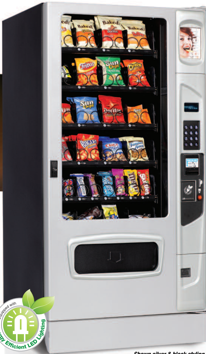
Shown silver & black styling and kick panel options.

The Mercato 4000 glass front snack merchandiser incorporates all the proven features you expect in a new design and includes additions that increase the value for choosing USI.