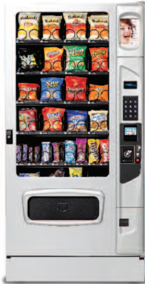
M4000 Shown with silver door color & kick panel options.