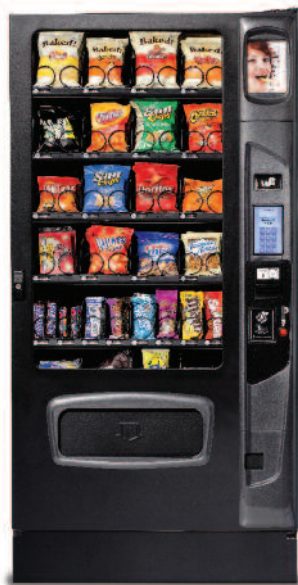
M4000 Shown with iCart touch screen & kick panel options.