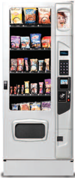
Shown with silver door color & kick panel options.