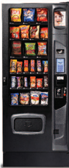
Shown with iCart touch screen & kick panel options.