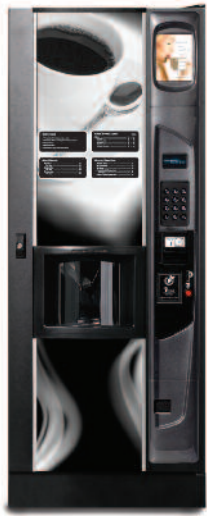
Shown with kick panel option.