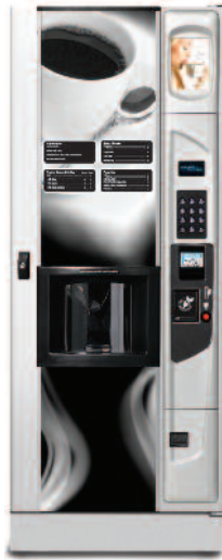
Shown with silver door and kick panel options.

Available in freeze dried, fresh brew or bean-to-cup configurations, the Geneva dispenses a broad menu of premium and specialty coffees and serves them just the way your customers like them.